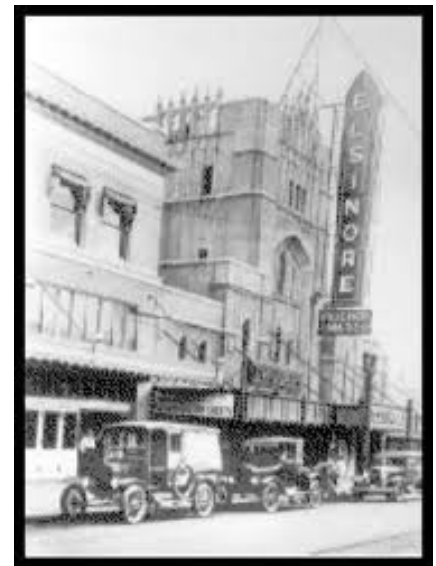
Elsinore Theatre 1926