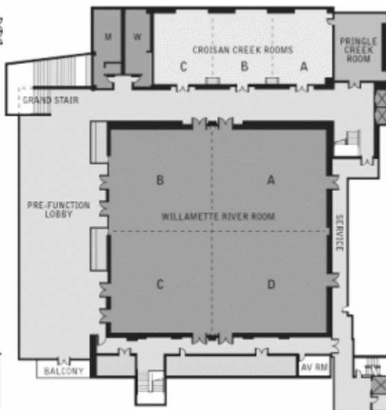
CONFERENCE CENTER – 2 ND FLOOR